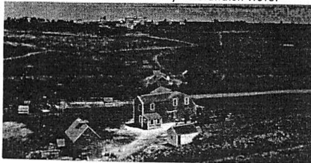
Old hotel from Captain's Hill